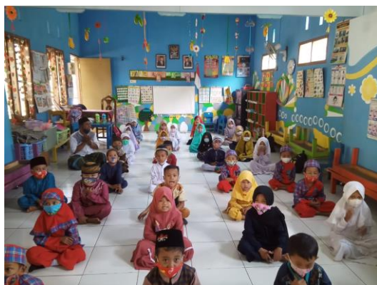
Figure 2 Tahfidzul Quran with the Wafa method