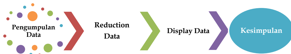
Figure 1. Data Collection Process

All data collected is then data reduction is carried out, processed on the data display, and drawn conclusions. The researcher can analyze and conclude the research conducted through the stages carried out.