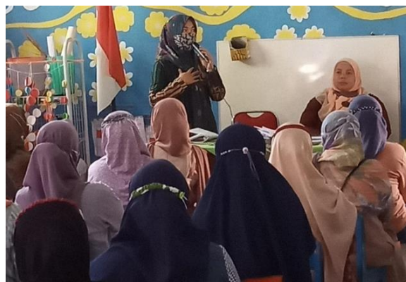
Figure 3 Socialization of the RA Masyithoh III program to Learning Group institutions or Child Care Parks in the surrounding environment

In Figure 2, it can be seen that the students of RA Masyithoh III are repeating the Quran reading as one of the only programs of tahfidzul Quran with the Wafa method. Of course, the school branding that has been attached to RA Masyithoh III is not just a name but is also proven by real applications in schools. School branding is a way in which students can apply some form of cultivation to become a hafidz and a hafidzah who will be the successor in the future.